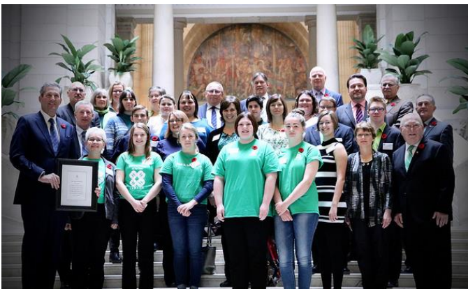
4-H Day being celebrated by Manitoba 4-H members and the many 4-H Alumni in the Manitoba PC Caucus