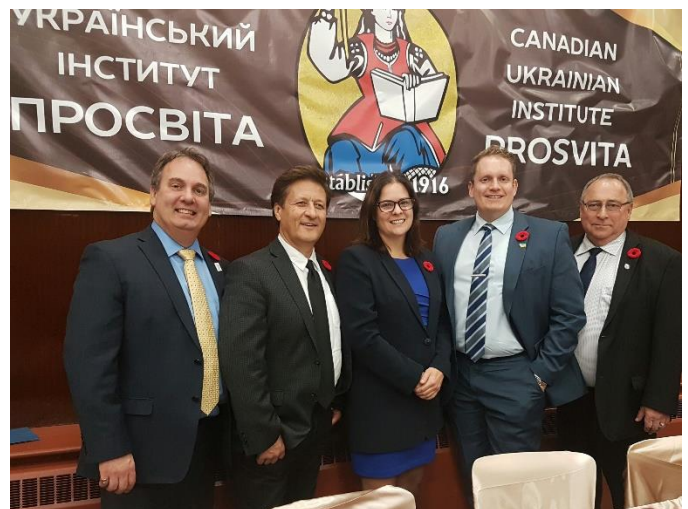
Blair Yakimoski, Ron Schuler, Heather Stefanson, Nic Curry, and Dennis Smook celebrate the 100 th Anniversary of Canadian Ukrainian Institute Prosvita