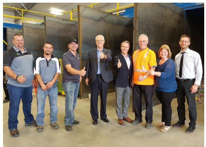
Finance Minister Cameron Friesen touring Gateway Resources new Recycling Depot