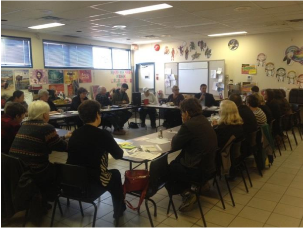
Growth, Enterprise and Trade Minister Cliff Cullen meeting with the Flin Flon Chamber of Commerce