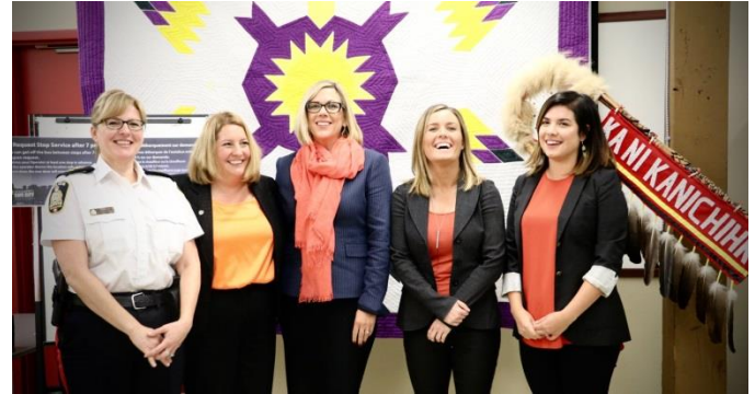
Status of Women Minister Rochelle Squires at an announcement for the Winnipeg Safe City initiative