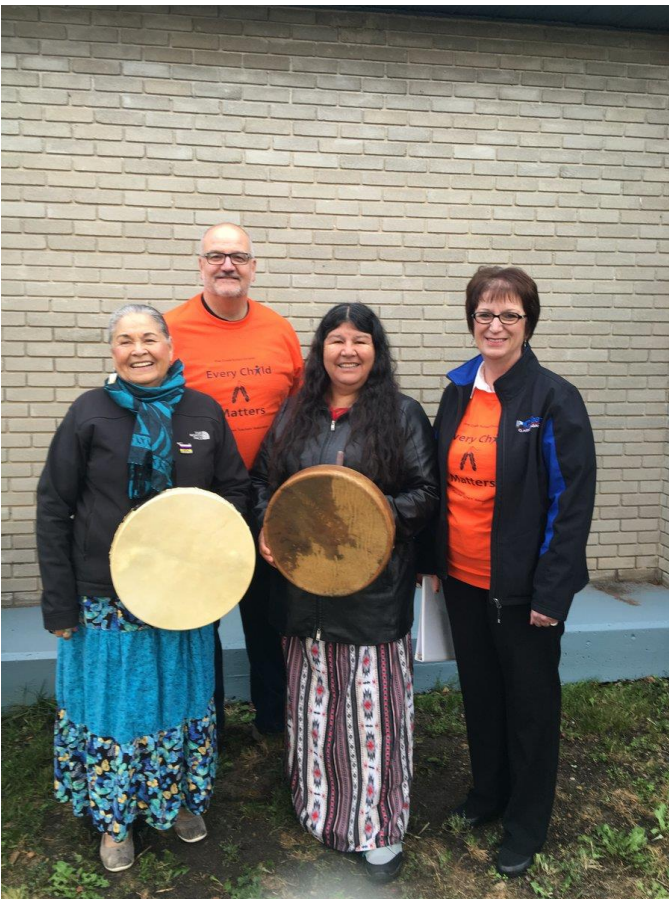
Indigenous Relations Minister Eileen Clarke takes part in Orange Shirt Day to honour survivors of the residential school system