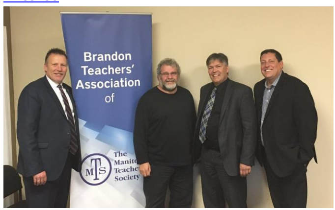
Education Minister Ian Wishart and Brandon East MLA Len Isleifson kick of the 2016-17 school year in Brandon

Minister Wishart also encouraged parents to take advantage of a number of a number of online resources available through the Government of Manitoba's website. These resources can be found here: <a href="http://news.gov.mb.ca/news/index.html?archive=&item=39150">http://news.gov.mb.ca/news/index.html?archive=&item=39150</a>